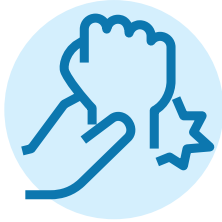
Sprains and strains

Your family doctor or nurse practitioner knows your health-care needs the best, but if you can't see them, visit the UPCC for same-day, urgent care for non-life-threatening health concerns.