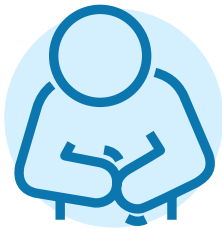
Nausea, diarrhea and constipation