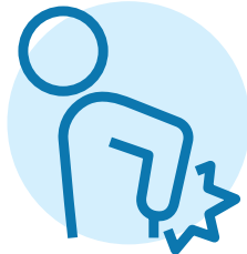
New or worsening pain