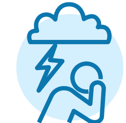
Mental health concerns such as low mood, anxiety or depression